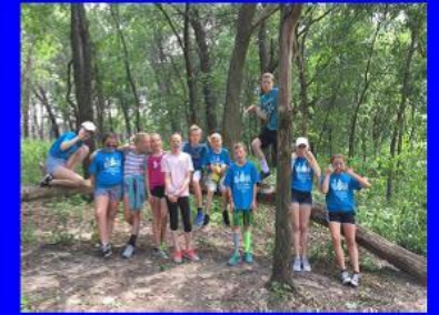
SCHOOL-AGE DAY CAMP 5 th grade Overnight Outing